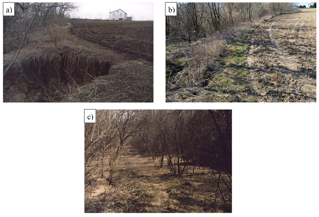
Fig. 3. Investigated gully: a) suffosion kettle cutting into the arable land; b) the border of plow cultivation; c) silted bottom of the gully

Apart from the anti-erosion management of land, the climatic conditions have a great influence on the development of the young gully indentations [Cerdan et al. 2002; Rodzik 2008]. In the Sandomierz Upland, the summer half-year, when the sum of rainfall is around 70% of annual [Miczyński and Siwecka 2012] and is quite high compared to other regions of Poland is the most predisposed in this respect [Czarnecki 1996]. From the agricultural point of view, this is a completely beneficial phenomenon; however, due to the low retention capacity and low soil protection of forests, resulting primarily from their small share in the total catchment area (forests are located only within the ravine and constitute 9% of the total catchment area), - the occurrence of very wet springs, years and autumn, in which the most rainfall >10 mm is also recorded, potential conditions for water erosion are created. The summer half-year is also the