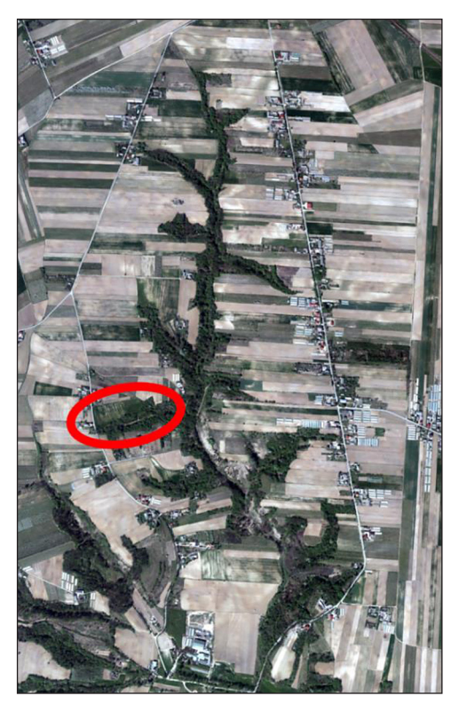
Fig. 1. Walley-gully in Gałkowice (Opatówka basin) and localization of the study area

According to Woś [1993], the Opatówka river basin belongs to the Central Upland District; however, due to the very low rainfall, the climate is not much different from the climate of the belt of the Great Valleys. The highest rainfall occurs in July (from 80 mm in dry years to 190 mm in wet years). The driest season is winter (XII-II), the sum of rainfall varies between 49-64 mm. The average an-